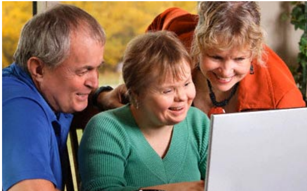
Enhancing technology empowers families and participants to take an active role in planning their future.