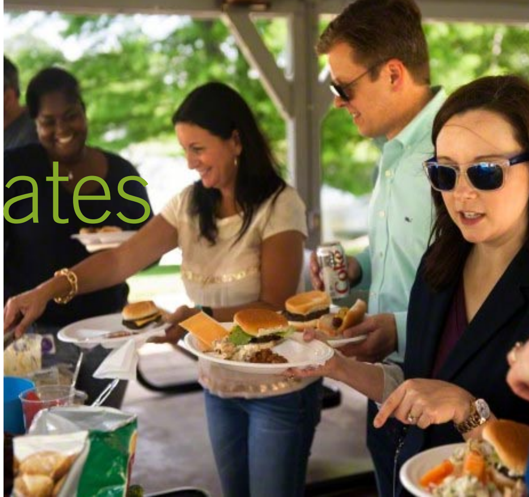
Staff and participants enjoy a perfect day celebrating and enjoying the freedom that recovery brings.

The PSCH Mental Health Staff Invites Program Participants to a Day In the Park