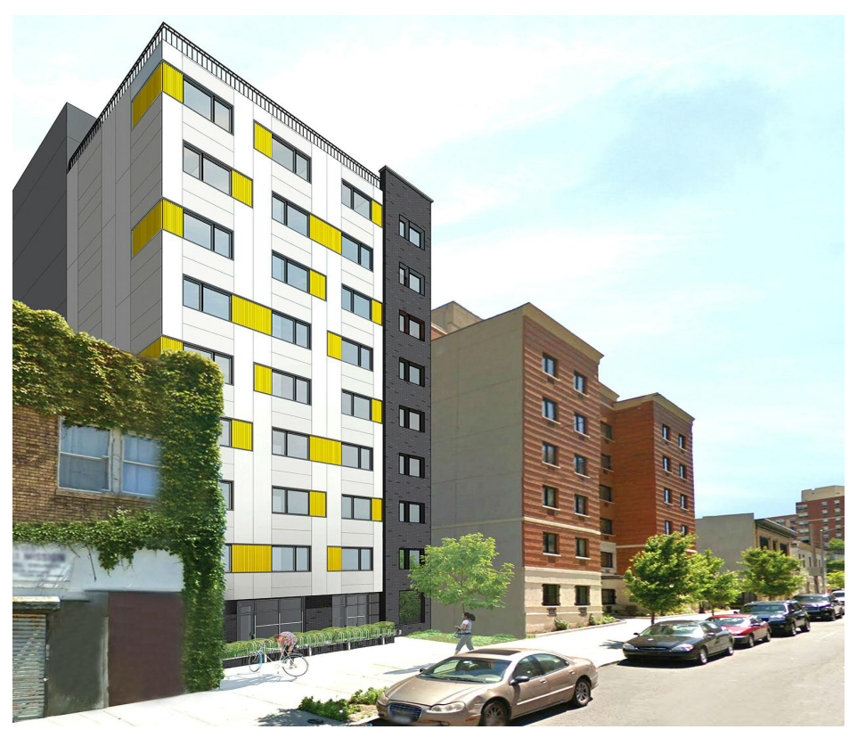
Our recently, opened mixed-use residence at 165th Street in the Bronx is home to some 58 individuals and families who enjoy landscaped gardens, community and exercise room.

WellLife Network is a New York-based health and human services agency whose mission is to empower individuals and families with diverse needs to realize